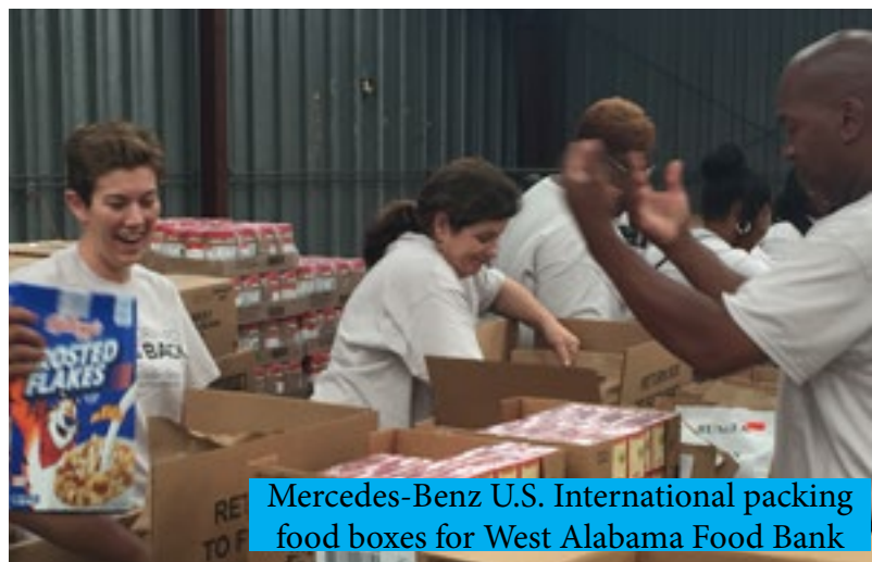
Mercedes-Benz U.S. International packing food boxes for West Alabama Food Bank