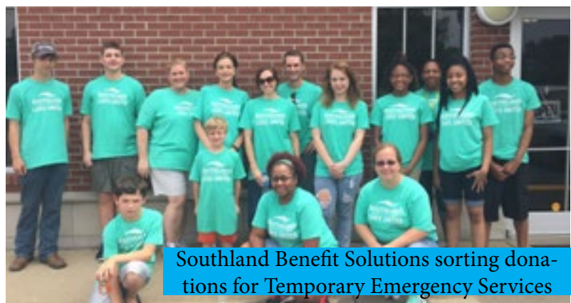
Southland Benefit Solutions sorting donations for Temporary Emergency Services

Every year, United Way hosts Day of Action, a single day where volunteers come together to improve our community. There are a variety of projects working with nonprofits and schools ranging from light office work to larger landscaping projects. #LIVE UNITED!