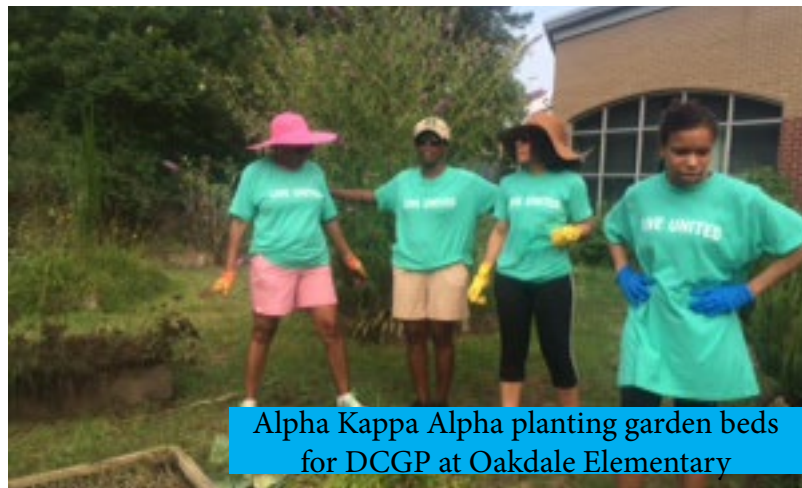
Alpha Kappa Alpha planting garden beds for DCGP at Oakdale Elementary

United Way of West Alabama strengthens education, income stability and health in our community by developing resources and partnerships.