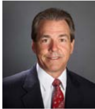
Nick Saban Head Football Coach The University of Alabama Honoree