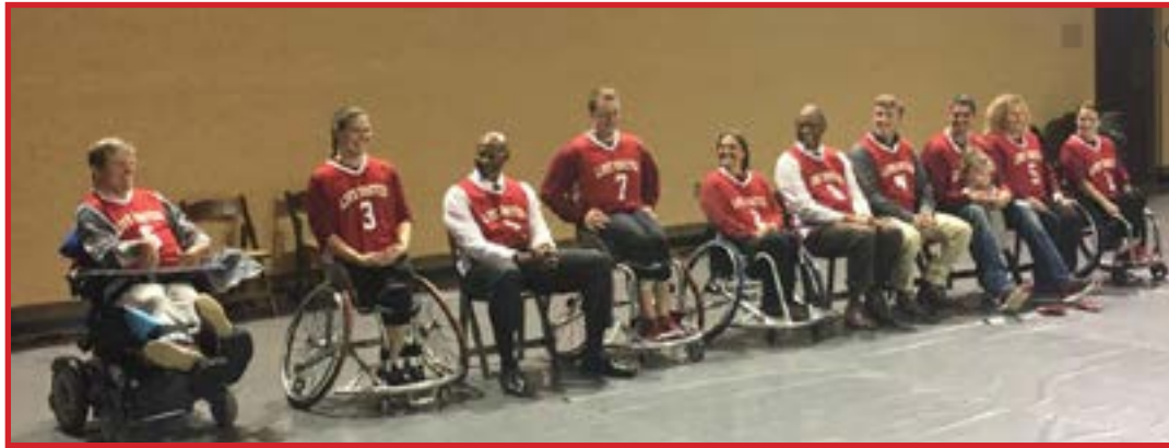
The campaign total was revealed at the Campaign Celebration at Foster Auditorium with the help of the Wheelchair Basketball Team & some special UWWA friends.

The Campaign Cabinet works closely with the Campaign Chairman to ensure the goal is met or exceeded by engaging new prospects and being ambassadors for employee campaigns throughout the nine-county service area. Their leadership & guidance are key to the success of the campaign.